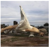
Forever Marilyn Turns Up in a Chinese...