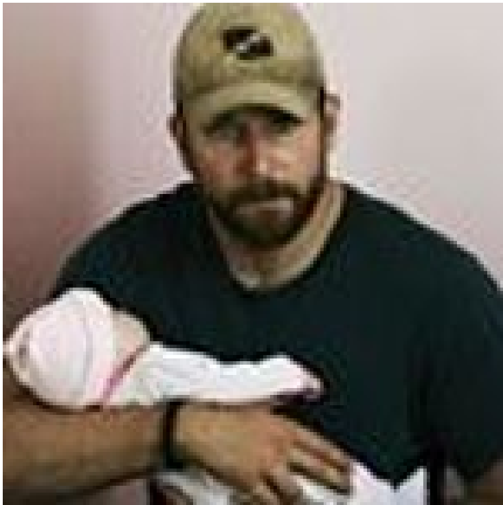
'American Sniper' fake baby real funny to some moviegoers