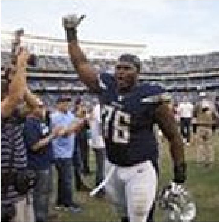
Hotel tax for Chargers stadium?

changers-stadium/ ) ( http://www.viralworld.net/not-your-typical-