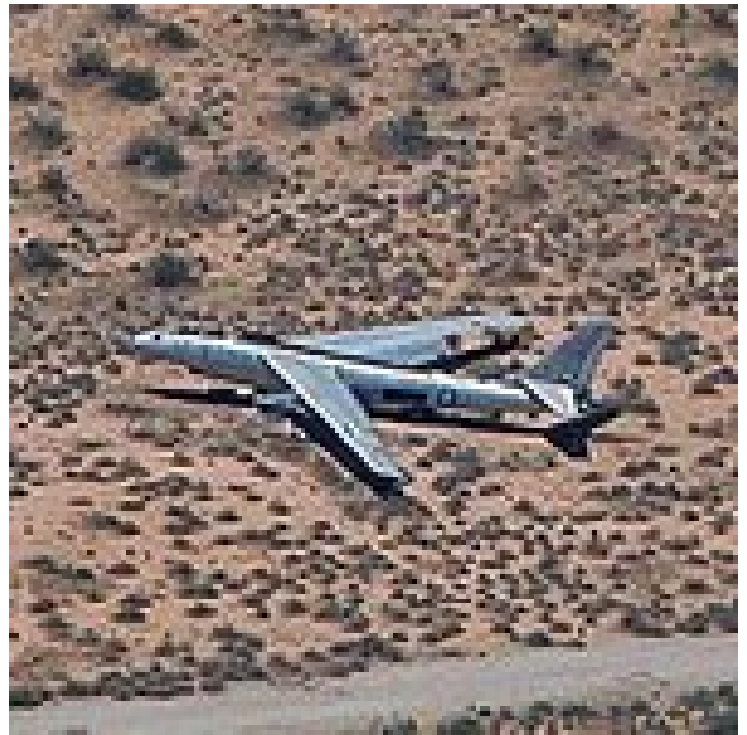
PHOTOS: 10 Times The Airplane Graveyard In The Mojave Desert Creeped Us Out (ViralWorld)

graveyard-this-is-the-place-where-airplanes-go-to-die/?utm_source=OB&utm_medium=ViralWorld%20-%20Desktop%20- %20US%20-