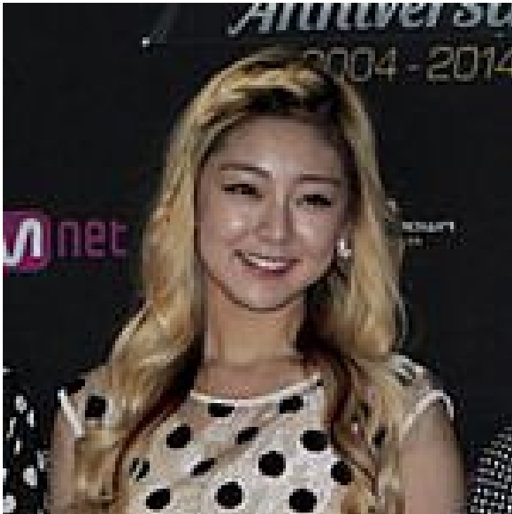
Second member of K-pop group dies from car crash

( http://m.utsandiego.com/news/2014/sep/06/second-member-of-k-pop-group-dies-from-car-crash/ ) ( http://www.aarp.org/personal-