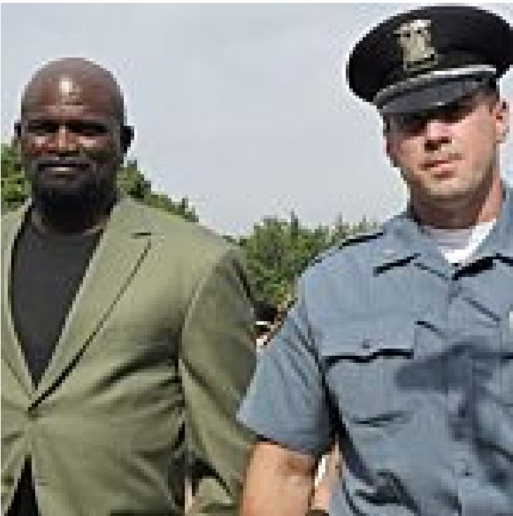
10 Athletes Who Have Hit Rock Bottom (SportsBreak)